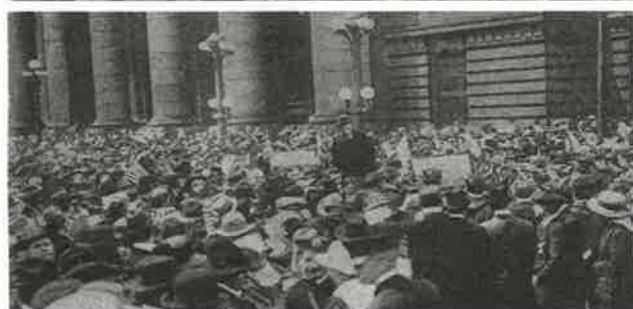
A Big Chicago Hello. In 1904 150,000 come to greet future Czechoslovak president, Thomas G. Masaryk.